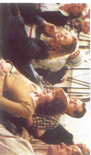
Guests attending a recent course

Alpha originates from the Church of England and is now being run by churches of all denominations in this country and around the world. It is also being used in most prisons. A youth version of the Alpha course is running very successfully in many schools and colleges. Alpha is helping Catholics respond practically to the challenge of evangelisation.